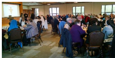
Participants engage in small group discussion and sharing during the May 2 meeting with Leadership of Religious.